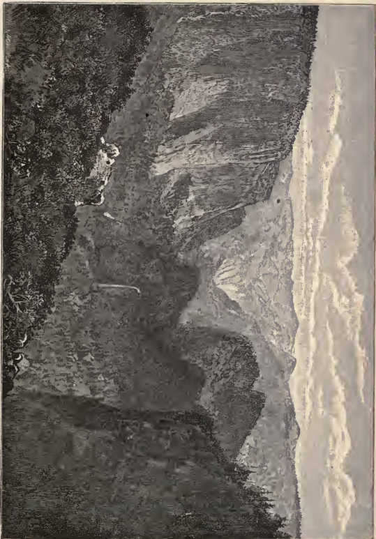
YOSEMITE VALLEY, CALIFORNIA.